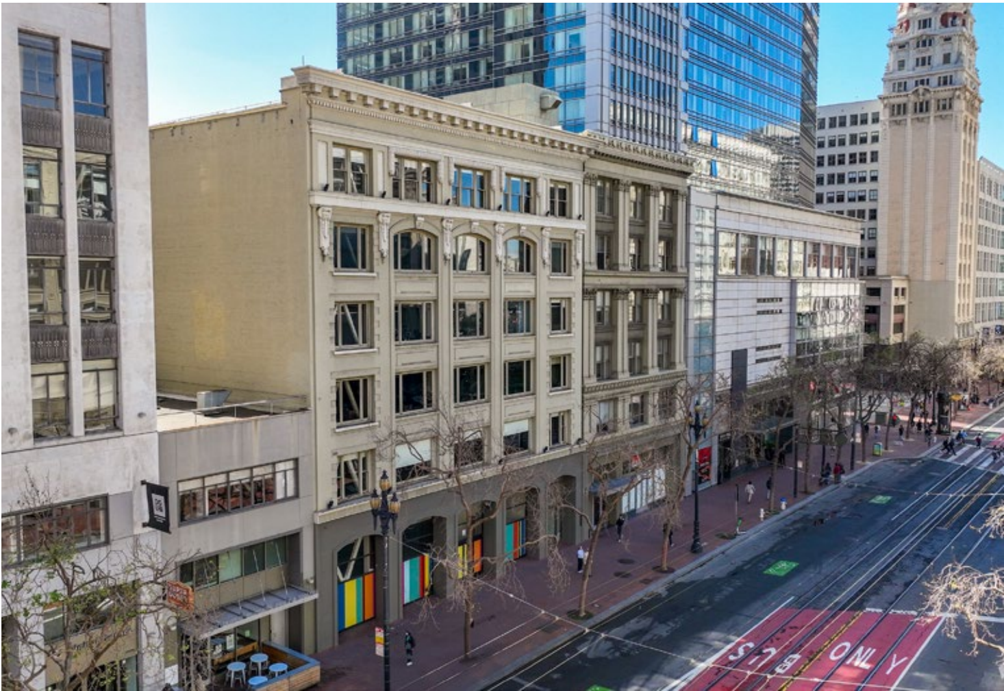
731 MARKET STREET

Tropisueno, Ippudo, Delarossa, Amber India, Mixt, Feng Cha, Lemonade, Super Duper Burger, Chipotle, Target, Peet’s Coffee, Blue Bottle Coffee, Press Club, Equinox, Four Seasons Hotel and AMC Metreon