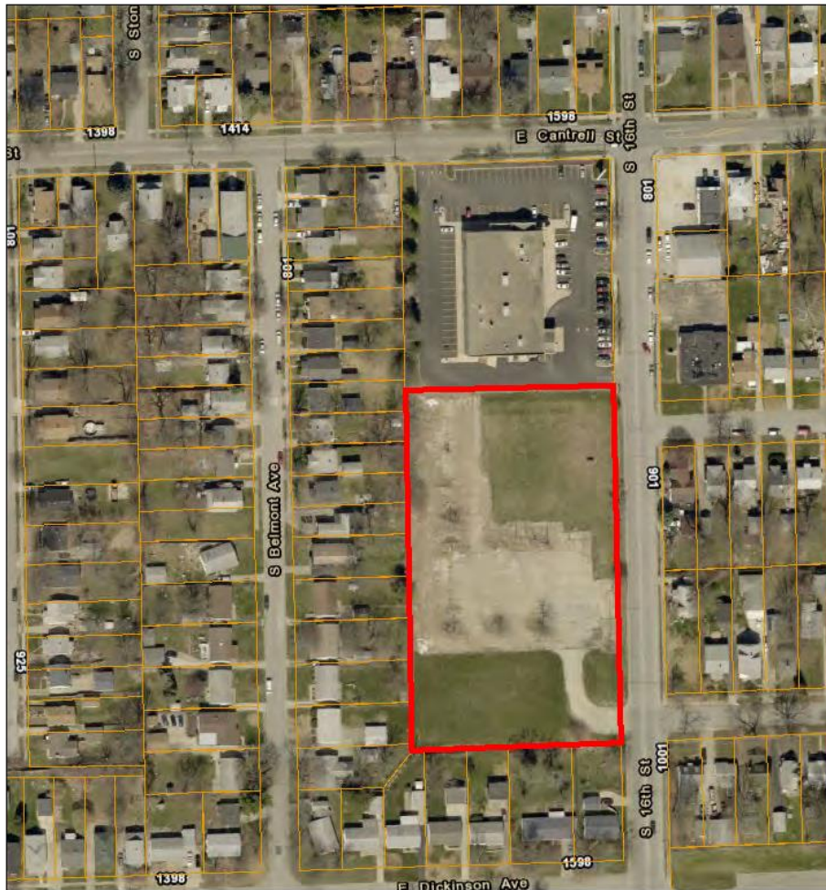
Macon County Parcel Viewer