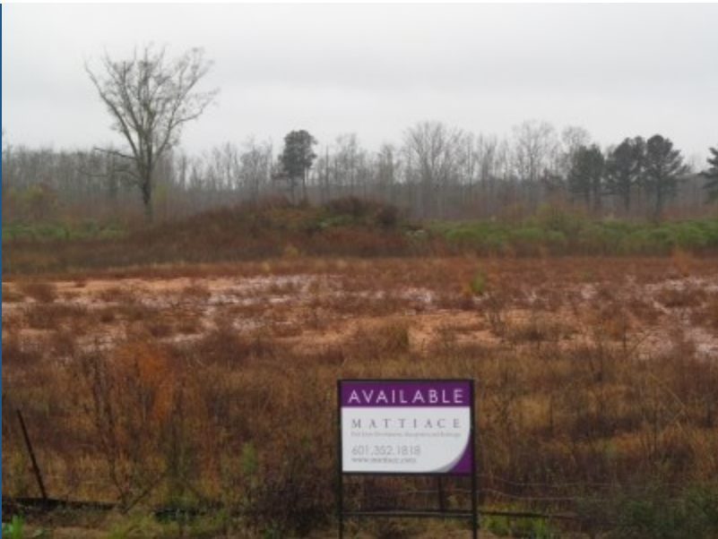
1.49 acres Hwy 18 @ Stonebridge

1.49 Acre Corner Out Parcel lot fronting Hwy 18 @ Stonebridge, Brandon MS. The lot has 260 front feet on Hwy 18. It is a level lot at grade with Stonebridge Road. Ingress/ egress from Stonebridge Road.